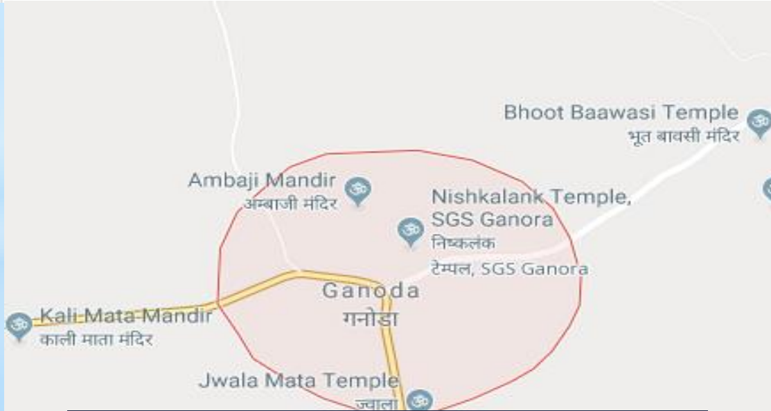
Ganoda, Banswara district, Rajasthan