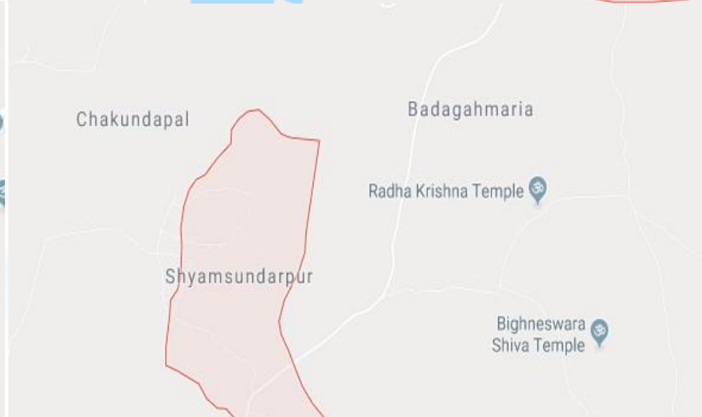
Shyamsundarpur, Kendujhar district, Odisha