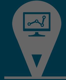
Global Reach and Accessibility to Rare Skills