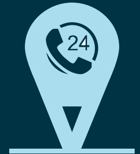
Analytics and User Experience Management