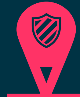
Best Practice Security